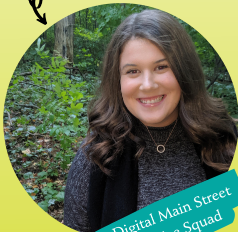
Digital Main Street Service Squad