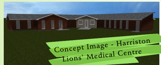
Concept Image - Harriston Lions' Medical Centre