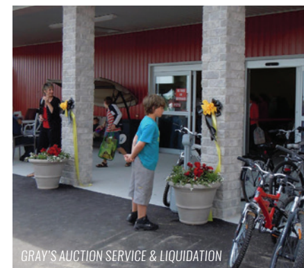
GRAY'S AUCTION SERVICE & LIQUIDATION