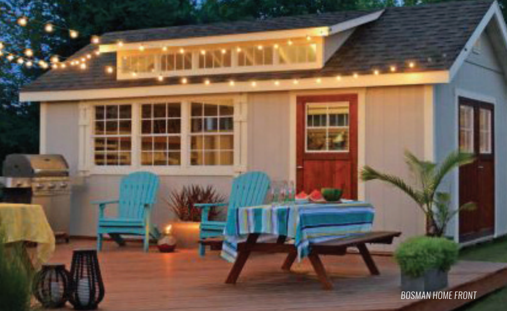
BOSMAN HOME FRONT