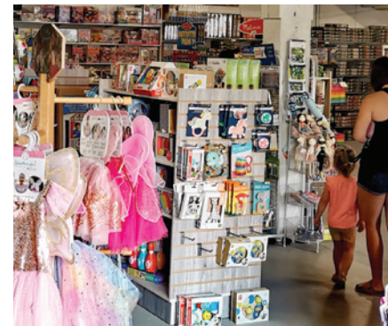
KIDDING AROUND TOYS & GAMES

This special partnership between the Minto Chamber and Town of Minto will launch in November 2022, just in time for the holiday shopping season.